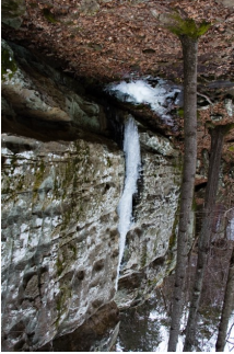
- Jackson Hollow—South Falls