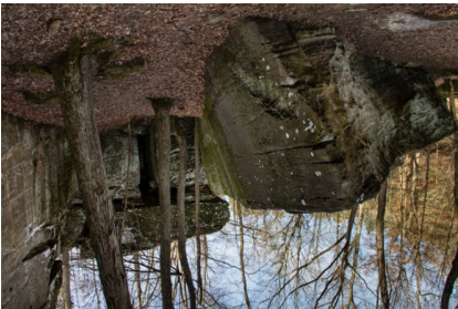
- Jackson Hollow - Keyhole Access