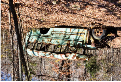
- Hippie Bus