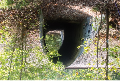
- Tin Whistle