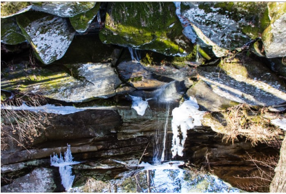
- Jackson Hollow - Dog Trot Falls