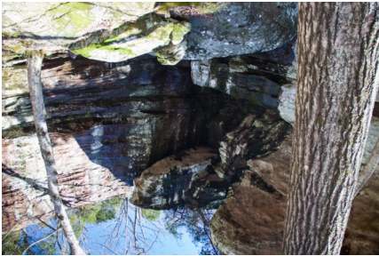
- Cove Hollow Falls