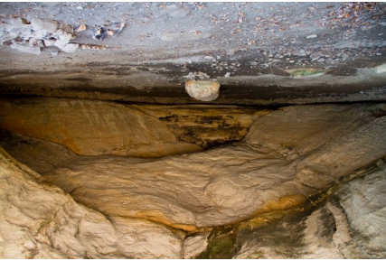
- Sand Cave