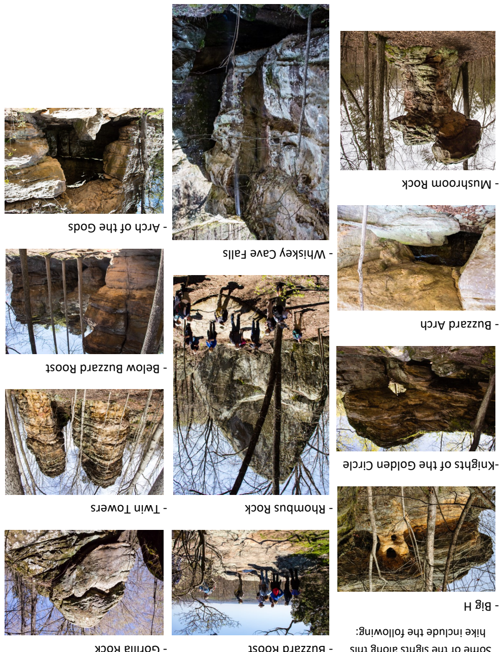
Some of the sights along this hike include the following: